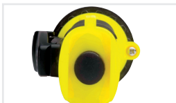
ELECTRONIC TACTICAL SWITCH