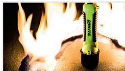
ZONE 0 ATEX COMPLIANT