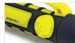
SAFETY GAS RELEASE VALVE