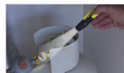
SMALL AND COMPACT

BATTERY 2 x 1.5v AAA Alkaline Batteries (not included) WEIGHT 41g (without batteries) DIMENSION 142 x 30 x 20mm