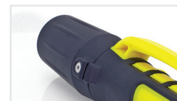
SAFETY LOCKING BATTERY COMPT.