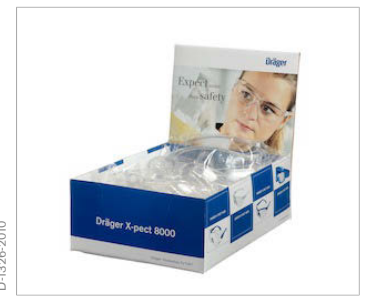
Display Packaging Dräger X-pect® 8000