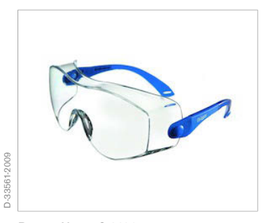
Dräger X-pect® 8120