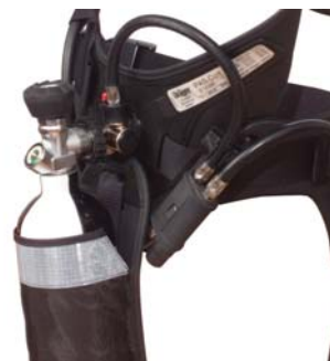
Dräger Automatic Switch Over Valve Uninterrupted air supply