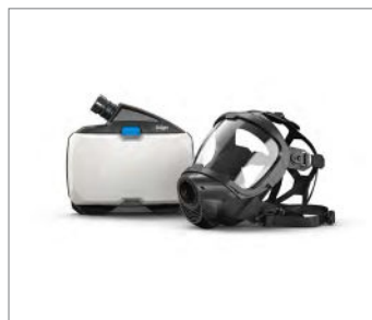
Exemplary combination with tight-fitting headpiece, here FPS 7000.