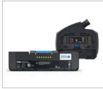
Replaceable battery with smart display for charging status