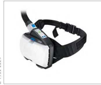
X-plore 8500 system with belt carrying solution