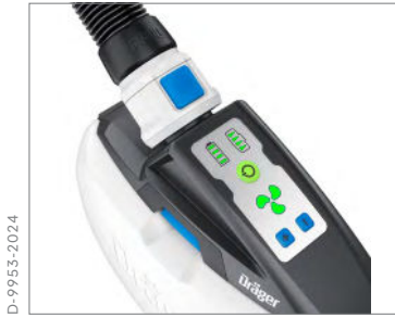
Status display for airflow rate, filter saturation and battery level