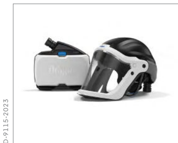
Exemplary combination with loose-fitting headpiece, here X-plore 8000 helmet PC visor HLI