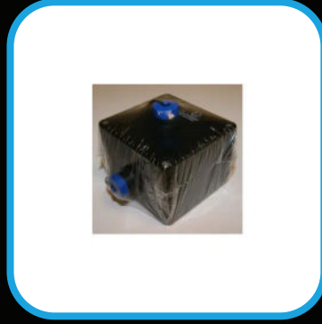
IRmax Remote Calibration Box

IRmax Remote Calibration Box is a specialised accessory designed for use in offshore environments, where harsh conditions demand durable and reliable equipment. This calibration box enables the remote calibration of the IRmax infrared gas detector.