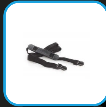
Shoulder Single Strap

Single straps which in combination with the chest harness plate enable the detector to be worn over the shoulder.