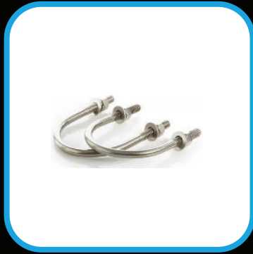
XgardIQ Pipe Mounting Kit

The Pipe Mounting Kit is an essential accessory for securely installing the XgardIQ gas detection transmitter to a variety of pipe sizes. Constructed from durable stainless steel, the kit includes robust U-bolts, nuts, and washers designed to provide a rigid and reliable mounting solution.