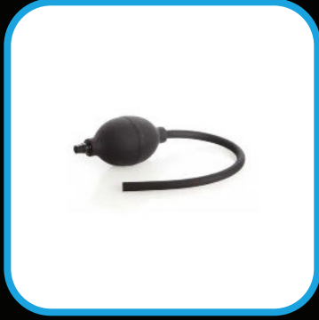
Hand aspirator bulb

and aspirator bulb is a key tool for manual gas sampling, providing a convenient solution when electronic pumps are unavailable or impractical. This handheld device allows users to draw gas samples manually from remote or confined areas, ensuring the safe analysis of potentially hazardous atmospheres before entry.