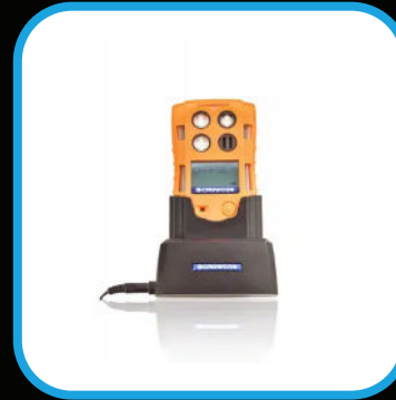
T4 Cradle charger

T4 Cradle Charger is a convenient and efficient docking station designed for the seamless charging of your gas detection devices. With its user-friendly design, the cradle allows you to simply dock the detector for quick and easy recharging, ensuring your equipment is always ready for use in critical situations.