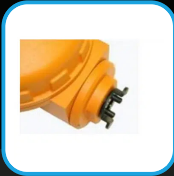
Xgard Bright Calibration Adaptor

Xgard Bright Calibration Adaptor is a critical accessory designed to facilitate the accurate calibration of the Xgard Bright gas detector. Calibration is essential for ensuring that gas detectors provide reliable and precise readings over time, especially in environments where hazardous gases pose significant safety risks.