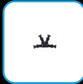
Crowcon Chest Strap Kit

Consisting of two straps, this Crowcon chest strap kit is built to accompany the harness plate (sold separately). This results in a seamless hands free experience, when applied to your Gasman or T3 gas detectors.