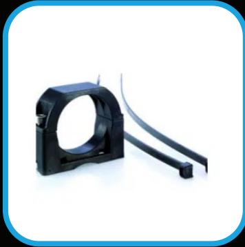
IRmax Mounting Bracket Kit

IRmax Mounting Bracket Kit is an essential accessory for securely installing the IRmax infrared gas detector to a wall or a 2" (50mm) pipe. The kit includes a mounting bracket, along with the necessary straps, nuts, and bolts for pipe mounting, ensuring that the detector is properly fixed in place for reliable gas detection.