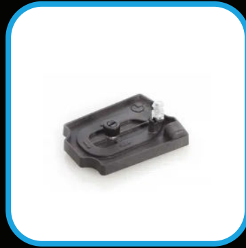
Gas-Pro Pumped flow plate

Gas-Pro Pumped Flow Plate is an essential replacement component designed for pumped Gas-Pro units, ensuring optimal performance of your gas detection system. This flow plate plays a key role in directing gas samples into the detector through the pump.