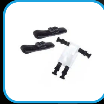
Gas Detector Chest Harness Kit

An all in one inclusive accessory, this Crowcon gas detector chest harness kit offers hands-free access to your portable gas monitor (Gasman & T3) while on the job.