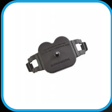
T4 Bump/Calibration plate

T4 Bump/Calibration Plate is an essential accessory designed for use with the Crowcon T4 Multi-Gas Detector, specifically for applying test gas during bump tests or calibration. Regular bump testing and calibration are critical for ensuring that gas detectors, like the T4, function accurately and reliably in hazardous environments.