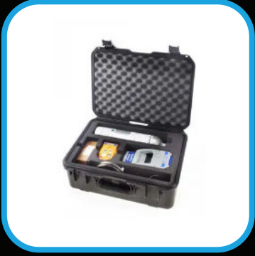
Gas-Pro CSE Kit Case

Gas-Pro CSE Kit Case is an ideal storage solution for professionals who require safe and secure transportation of their gas detection equipment. It is designed with a custom foam insert that ensures all components are kept organised and protected during transit. The foam insert includes designated spaces for essential equipment.