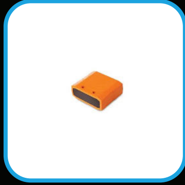
Clip SGD IR Link

Clip SGD IR Link is a versatile tool designed to enhance the functionality of your gas detection devices. With the IR Link, users can easily change settings, upgrade firmware, download event logs, and perform calibrations. This capability ensures that your gas detectors remain up-to-date and fully functional.