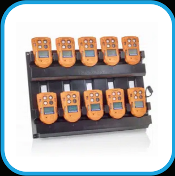
T4 10 way charger

T4 10-Way Charger is an efficient charging solution designed to charge and store up to 10 Crowcon T4 Multi-Gas Detectors simultaneously.